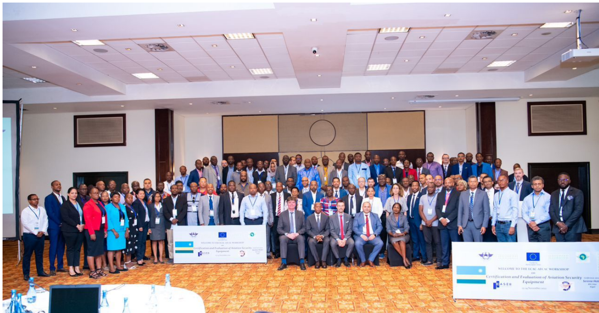
Group Picture – 23 November 2022

The CASE II Project's fourth workshop collaboration with AFCAC and the second in-country workshop saw the delivery of a regional workshop on the topic of the Testing and Certification of Security Equipment hosted by the Rwanda Civil Aviation Authority in Kigali. One hundred and one participants from 47 AFCAC