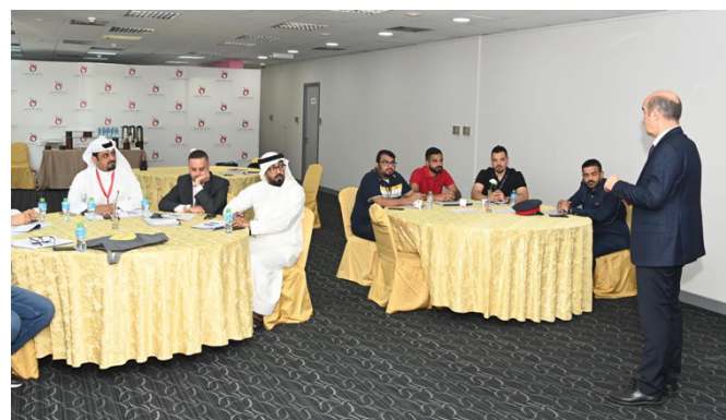
CASE II Expert and participants during a training session

Representatives of all organisations responsible for ensuring landside security shared a common conclusion that they had received knowledge and skills that revealed opportunities to optimise the performance of their tasks.