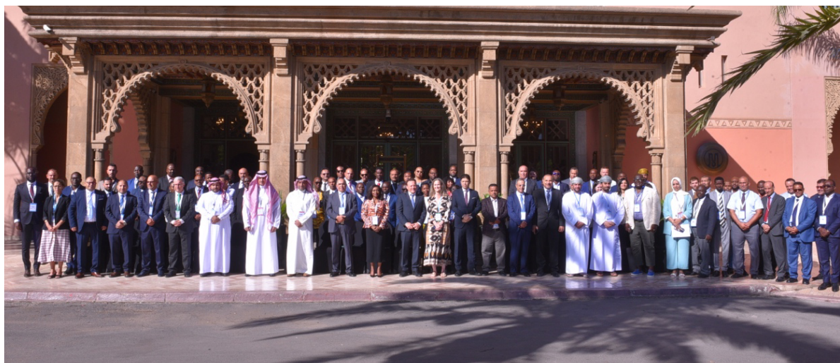
Conference Group Photo - 07 September 2022

This workshop was jointly organised by the Arab Civil Aviation Organization (ACAO), the African Civil Aviation Commission (AFCAC), ECAC-CASE II and TSA to bring 110 participants together from 46 Partner States to discuss various topics in the domain of Innovation and Cybersecurity in Aviation Security.