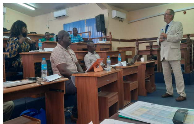
Member State Expert and participants during the training

the coming months, and planning is underway to deliver further capacity-building training to them.