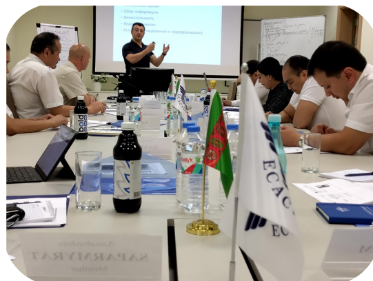
The expert from the State Civil Aviation Agency of Kyrgyzstan in an in-classroom session.

The CASE II Project Team would like to extend its thanks to the Appropriate Authorities of Kazakhstan, Kyrgyzstan, and Turkmenistan for their proactive cooperation and their engaged participation.