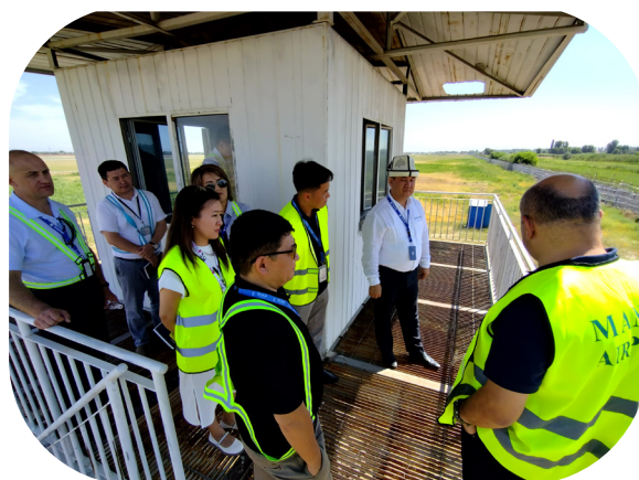
Participants during a practical exercise.

The CASE II Project would especially like to thank the State Civil Aviation Agency of Kyrgyzstan for its willingness to host this pilot and looks forward to further delivering this activity for the benefit of other Partner States in the near future.