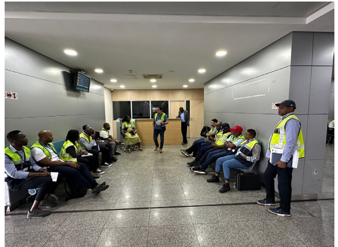
The participants and instructors during a practical exercise in Angola.

The Project Team thanks its colleagues from the Portuguese ANAC and looks forward to continuing our mutual support in the months to come.