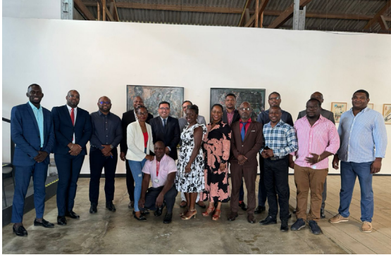
Group photo of the participants and the experts from the Portuguese ANAC in São Tomé

The CASE II Project has continuing to strengthen its robust partnership with the Portuguese Autoridade Nacional da Aviação Civil (ANAC) by supporting the delivery of multiple multilateral aviation security trainings to lusophone Partner States in Africa.