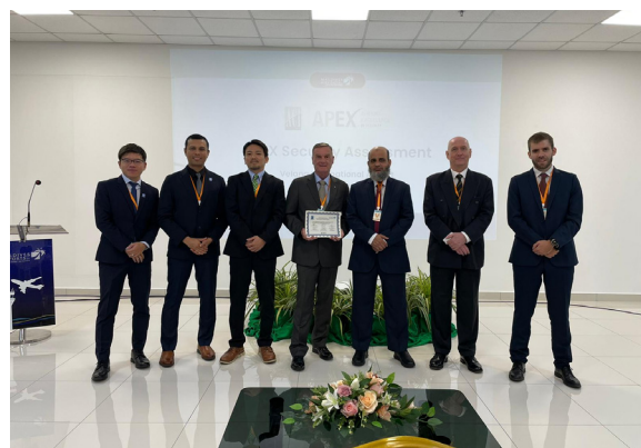
The CASE II Aviation Security Specialist with the team of ACI experts.

The Project Team would like to extend its appreciation to the team at ACI World and for the delivery of the six APEX in Security Reviews over the last year and a half for the benefit of airport operators in Partner States.