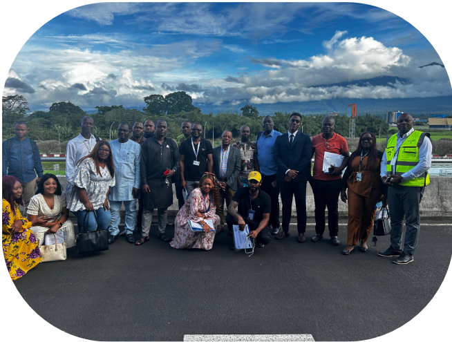
Group photo with the participants and instructors

These back-to-back and complementary activities are the third and fourth activities, respectively, to be delivered in Equatorial Guinea for the benefit of participants from the Agência Aeronáutica da Guiné Equatorial (AAGE).