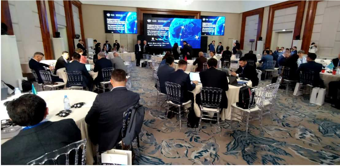
Participants in the seminar venue.

The CASE II Project is pleased to be participating in this important regional discussion, having been highly active in delivering capacity building activities in the region in the last two years, and thanks ICAO for its invitation to contribute.