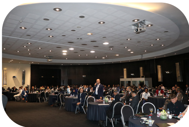
Participants in the workshop's conference hall.

Hosted by the Direction Générale de l'Aviation Civile (DGAC) of Morocco in Casablanca,