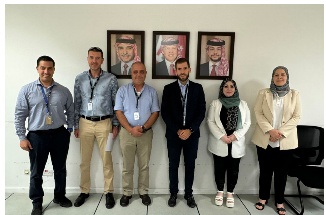
The instructor with participants following the activity.

Finally, the Project Team would like to thank all participants and stakeholders for their commitment and looks forward to delivering more activities for the benefit of the Kingdom of Jordan in the remaining year of the Project's implementation.