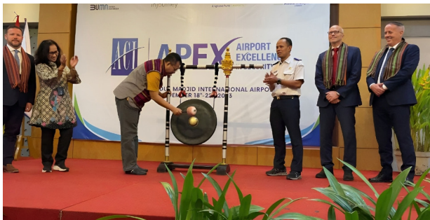
ACI Experts with the senior airport management during the opening ceremony.

Five security auditors provided by ACI - from Ireland, Jordan, Macao, Australia, and Canada- were accompanied by one expert representing the CASE II Project, released by the Dutch Ministry of Justice and Security in an observer capacity.