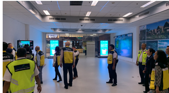
ACI experts during an auditing activity

The CASE II Project would like to thank the Indonesian civil aviation authorities, Angkasa Pura I Airports and Lombok International Airport for their participation in this review and the Project Team looks forward to the opportunity of strengthening partnership with Indonesia.