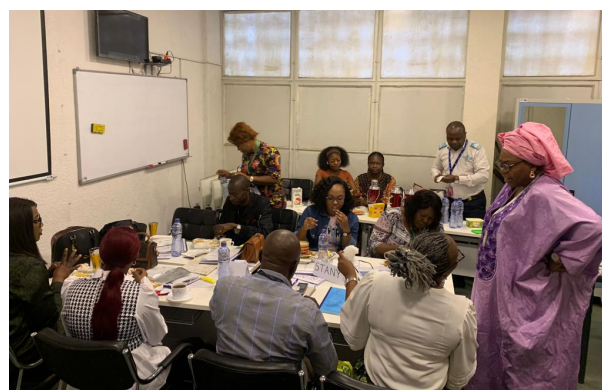
Participants during a classroom exercise.

The strong feedback from both the participants and the Partner State indicated that the activity was constructive and beneficial. Moreover, participants were unanimous in giving concrete examples of follow-up actions inspired by the training that would be taken to reinforce security auditing in the DRC.