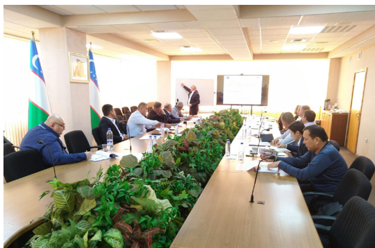
The external expert with participants in classroom training

Prior to this activity, the Civil Aviation Agency of Uzbekistan had engaged once with the CASE II Project by sending two aviation security experts to a multilateral training activity for national auditors, hosted in Kazakhstan in March 2023. This is the first on-site activity organised in Uzbekistan.