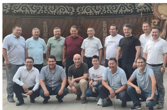
Group photo of the participants and the instructors.

The Project Team would like to extend special thanks to our Kyrgyz partners for hosting this fifth multilateral, Russian-language activity in Central Asia and to the AAK for the release of an expert to deliver the activity together with the CASE II expert.