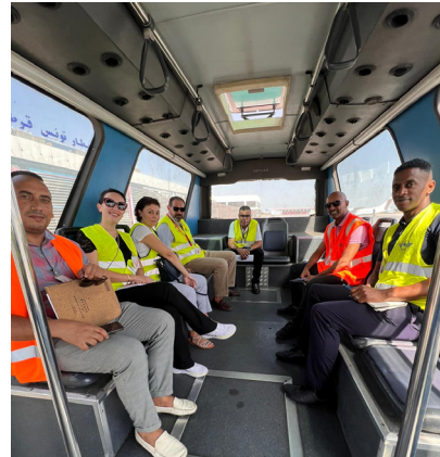
Participants and instructors going to a practical exercise.

Activities were divided between classroom training and practical exercises carried out at Tunis-Carthage International Airport. Feedback from the participants showed high satisfaction with the content and delivery of the activity. Moreover, proposals for follow-up actions included changes to auditing techniques and processes inspired by the training, indicating a beneficial impact on security auditing processes in Tunisia.