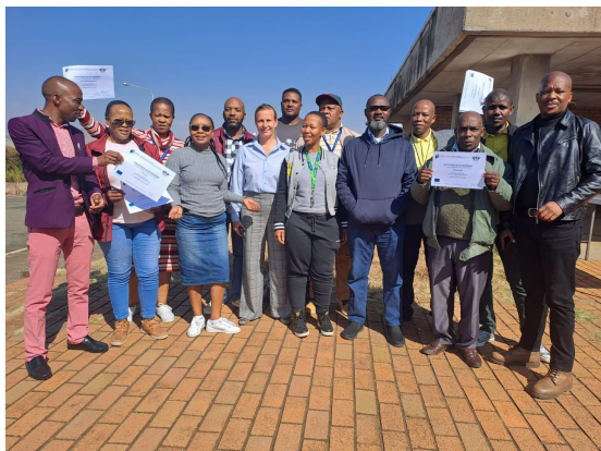
Group photo of participants and the instructors.

Two experts from the Project Team, an Aviation