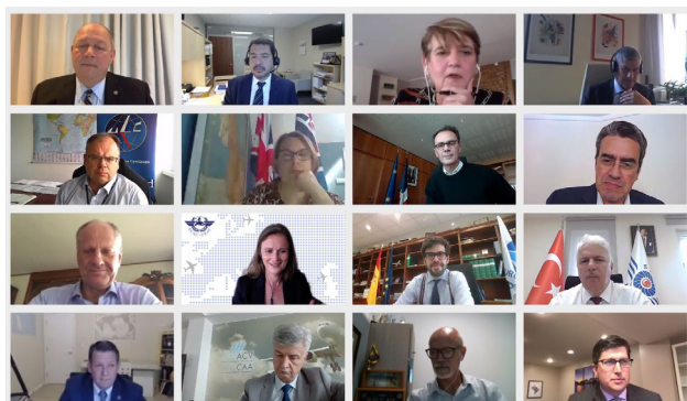
ECAC and US delegations, 3-4 June 2021