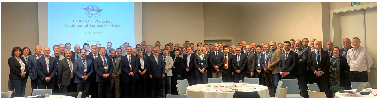
Participants in the ACC workshop in Bratislava

During four workshop sessions, participants discussed eight case studies, and the importance of improving communication between the various stakeholders involved in safety investigations, as well as the need to facilitate data sharing and analysis to enhance the effectiveness of safety investigations. They also discussed the importance of applying a proactive approach to safety management, where incidents are viewed as opportunities to improve aviation safety. ■