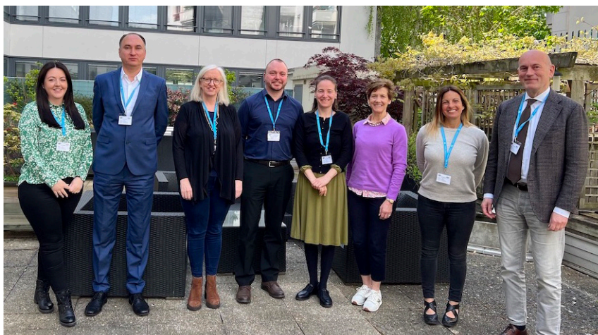
Participants joining the GMTF meeting at the ECAC offices in Paris

Having discussed policy and regulatory issues pertaining to cargo and mail security and recent changes to the EU aviation security legislation, the task force agreed to complete six additional tasks in