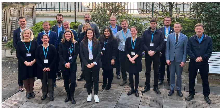
Participants attending on-site the workshop on recruitment, training and certification of screeners, ECAC offices